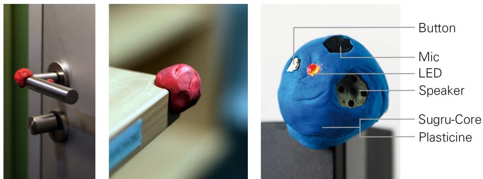
Figure 2: NUBSL can be placed everywhere you want. Right: prototype receiving an urgent message.

In order to achieve a flexible placement of the NUBSL prototype, it was realized by using plasticine and Sugru (Sugru 2013) as base material. Inside the device, there is a speaker, a RGB-LED, a microphone and a button to implement the functionality described before (see Figure 2). For the audio output and input a voice recorder was disassembled and the parts were connected to an Arduino™ controller (Arduino 2013). Several parts of the voice recorder are controlled by the micro-controller as well as the communication with the user's home. In case of an alert, serial port communication is used, e.g. sending prepared notifications to the smartphone.